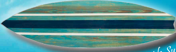
HT-71-WT The Seaside Susie