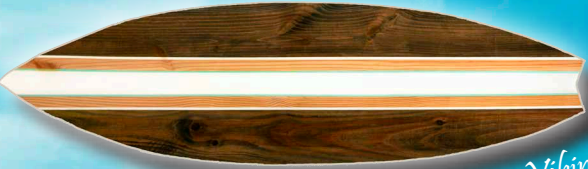
HT-70-WT The Ocean Viking