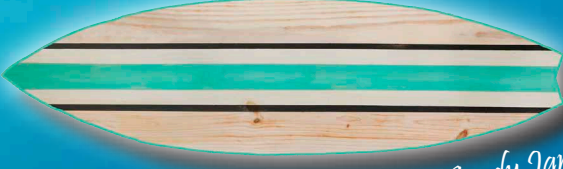
HT-72-WT The Sandy Jan