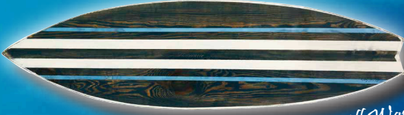
HT-74-WT Jack of All Waves