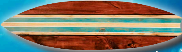
HT-73-WT The Seabreeze Shimmy