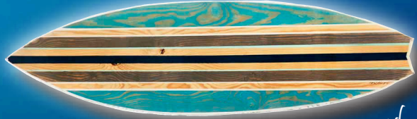
HT-75-WT The Legend